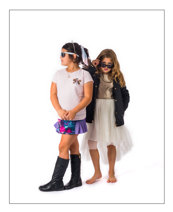
2nd Place Just Part of Growing Up in DC

I met these girls (6 and 8) with their mom and new puppy while dog walking. A few months later, the younger girl showed up at the dog park with soccer shorts and black Michael Kors boots. She would have slept in them if allowed. I asked if I could photograph them for my portfolio, mom and I cooked up some ideas, I got what I wanted, they were ready to leave, then they asked if they could come up and shoot some more. This was among the results. They were so much fun!