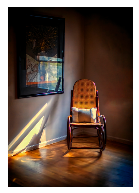
2nd Place A Quiet Rockin' Reading Corner

I am a voracious reader and love perusing my books in this corner rocking chair because of the wonderful soft natural light that bathes me in it all day long. One afternoon I was suddenly captivated by the sunlight surrounding the chair, casting soft shadows on the wall and floor and a gentle reflection in the glass. I quickly grabbed my camera and captured a scene that I have seen for years, yet not truly seeing the beauty hidden in plain sight until now.