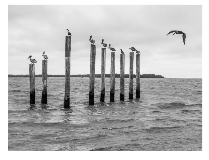
1st Place Where's My Pole?

This image was made in Chincoteague. We took a nature tour on a small pontoon boat. As we approached these poles, I was struck by the fact that each pole was occupied by a sea bird with a regular changeover of pole occupants as birds flew in and birds flew out. It's challenging to get a sharp image on a moving boat but I was able to make adjustments to increase the shutter speed. I opted to make this a black and white image since the existing color didn't enhance the image.