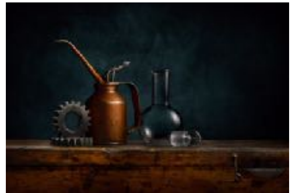
Work Shop Bench