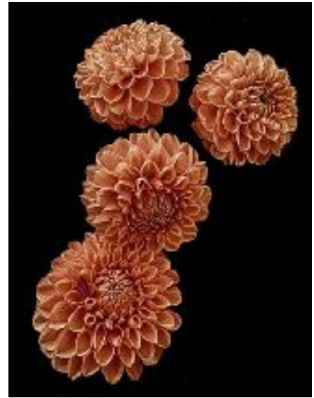
At the Market ©Diane Poole