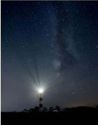
Bodie Lighthouse