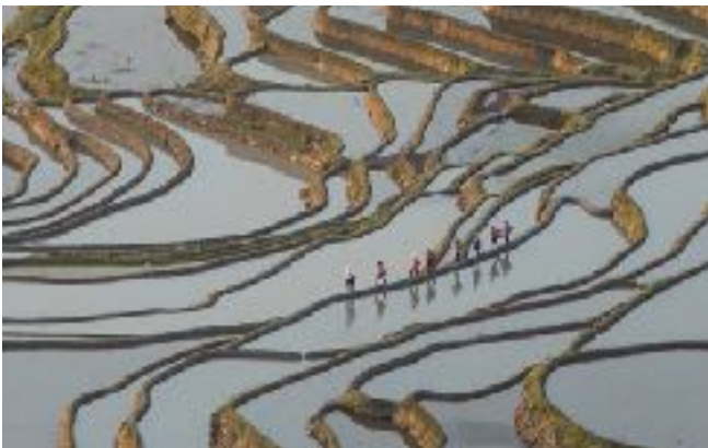
Yunnan Rice Terraces