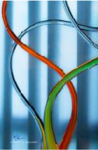
Corning Curls