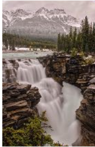
Athabasca Falls Jasper