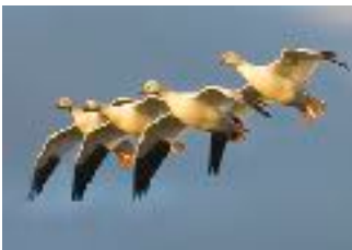
Snow Geese Pattern

There will be a field trip to the Middle Creek Wildlife Management Area (located in Lancaster and Lebanon counties, managed by the Pennsylvania Game Commission) in mid-/late February 2018 . The refuge usually hosts more than 100,000 snow geese, 10,000 tundra swans, and 10,000 Canada geese that have stopped at Middle Creek while pushing north to their breeding grounds. It's also a great place to see northern harriers, or "marsh hawks," nesting as well as immature bald eagles, and more common creatures such as white-tailed deer and red-tailed hawks.