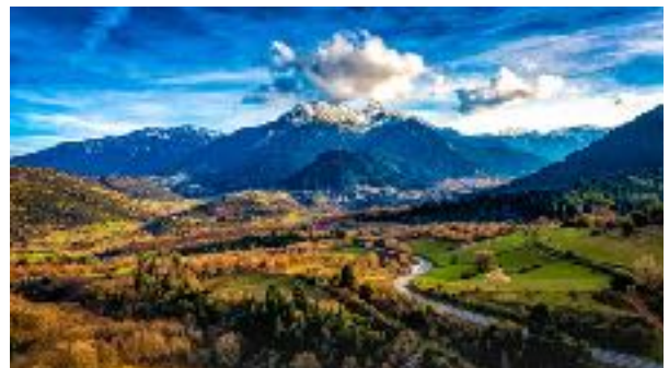
Mountains of Achaia, Greece