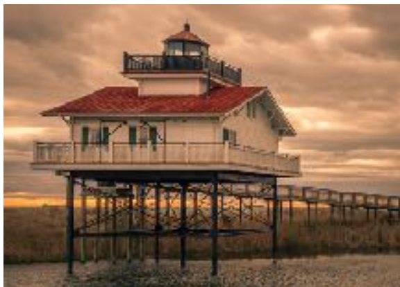
Beacon