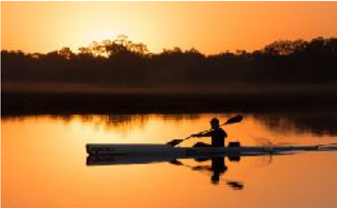
Orange You Glad to Be on the Water in the Morning ©Steven Frahm