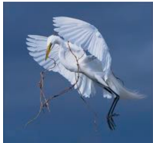
Great White Heron