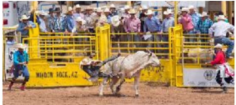
White Lightning