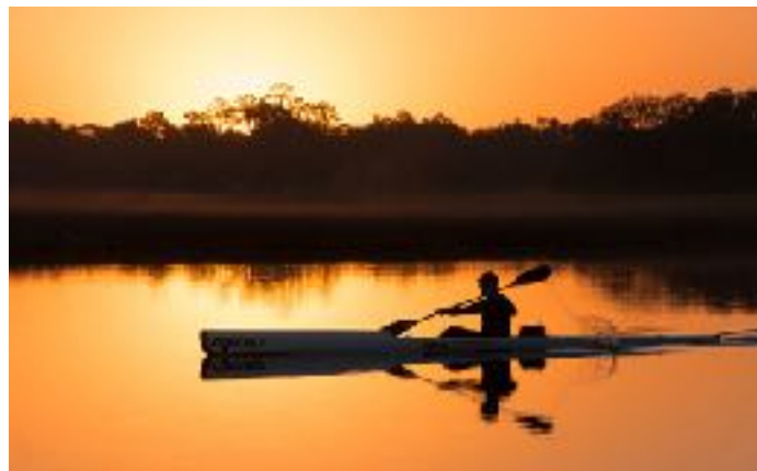
Orange You Glad to Be on the Water in the Morning

Photos must have been taken on or after June 1, 2016.