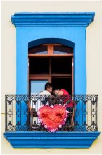
Valentine's Day