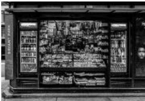
Manhattan Newstand