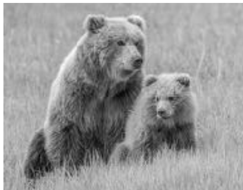
Mother and Daughter