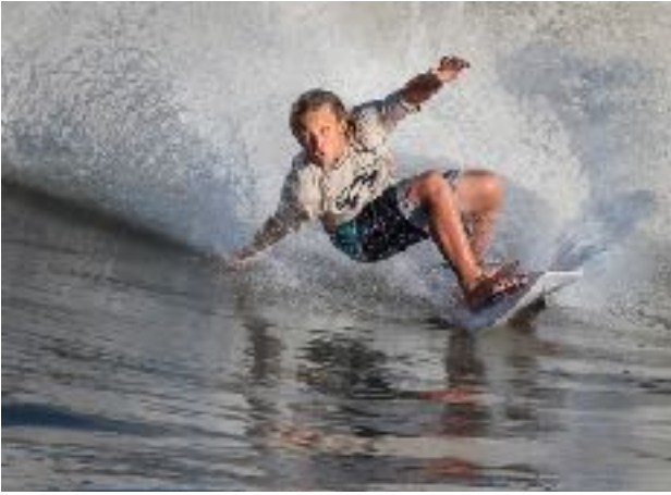
Surfer